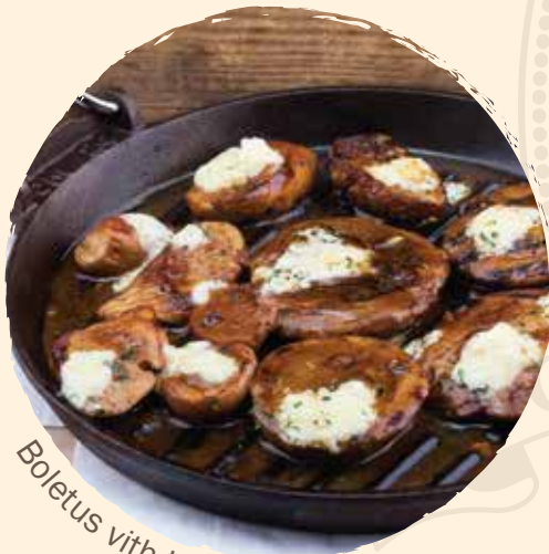
Boletus vith kaimak