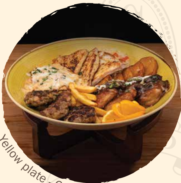
Yellow plate - Grand