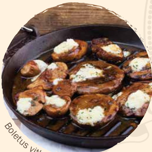
Boletus vith kaimak